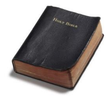
The Bible is the Word of God